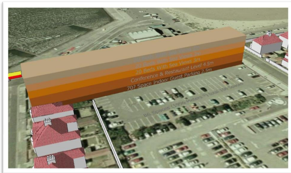
Figure 1 - For scale only 60 bed sea view model with ground floor parking

For information visit www.westkirbyrenewal.org.uk and www.westkirby.net download forms from www.wirral.gov.uk until 3 rd October