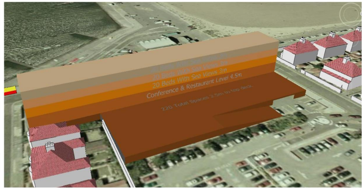
For scale only 60 bed two deck model – unacceptable & expensive